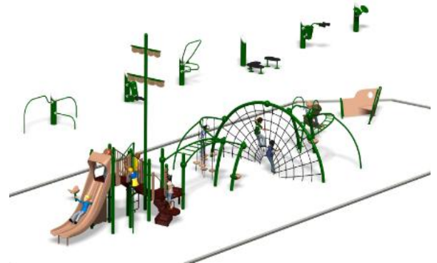
Proposal from Playgrounds-R-Us