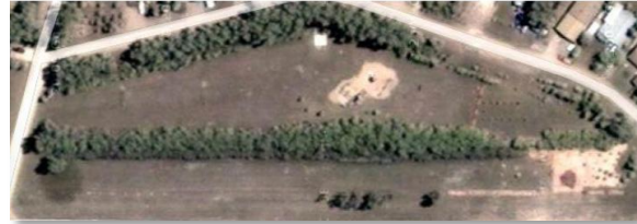
Google Map view of current park area