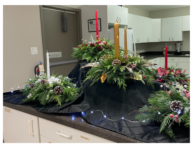
Christmas Centerpiece Class - December 11th 2023