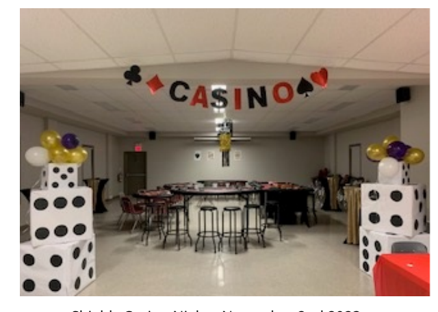
Shields Casino Night - November 2nd 2023

music. We are running the show from 5:30-11:00PM nightly for all to see. We have an illuminated red button for people on foot to enjoy the music, and you can also tune to 97.5FM in your vehicle. You can control the show by choosing your favourite sequence from your phone by visiting 73Procter.com. We have had it running for nearly a month now, it's wonderful to come home to see children dancing out in the street or cars gathered round enjoying the show.