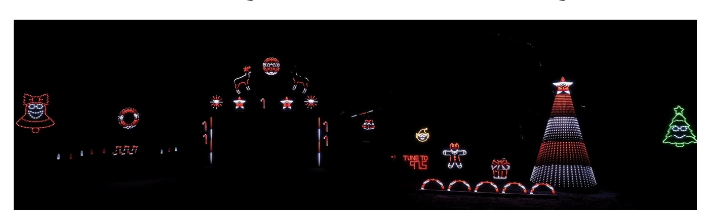
Pysden's Christmas Display - 73 Procter Drive

With the Christmas season upon us, you can't help but notice all the hard work people are doing around the village to get their light displays set up for all to see. This was a year of new challenges for Jaclyn and I at 73 Procter, as we decided in April to start planning and building our Christmas display. When the dust settled, we ended up with 6,722 LED lights sequenced to