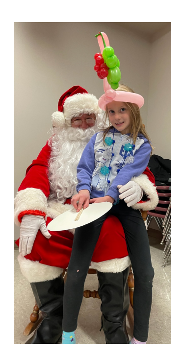
Children's Christmas Party - December 9th 2023