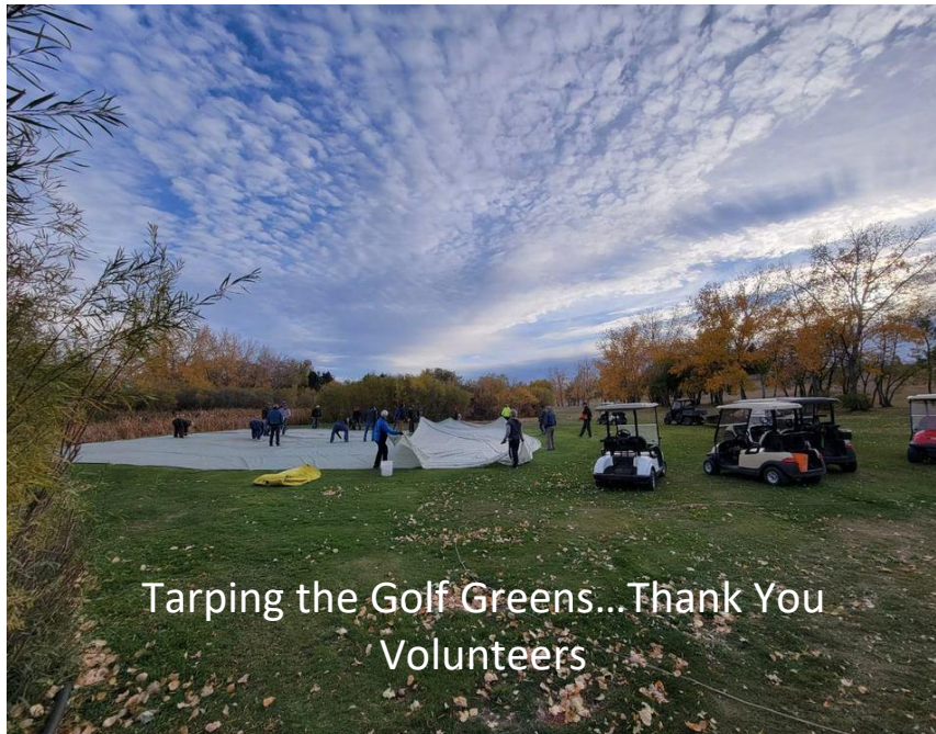
Tarpping the Golf Greens...Thank You Volunteers