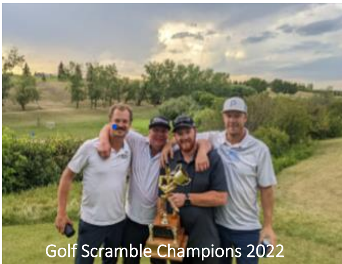
Golf Scramble Champions 2022