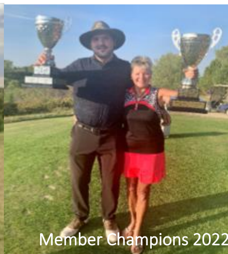
Member Champions 2022